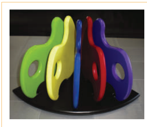
Figure 2—UV-cured powder coatings on MDF.

There are several types of medium pressure mercury vapor UV lamps available for UV curing of powder coatings. Mercury lamps ("H" bulb) provide short wavelength UV energy (220–320 nm) that is suited for clear and tinted applications. Mercury lamps with an iron additive ("D" bulbs) provide higher wavelength energy (320–400 nm) that aid in curing for low level pigmented systems. Lamps with a gallium additive ("V" bulb) provide a strong output of long wavelength energy (405–440 nm) and are the workhorse for pigmented systems. Long wavelength energy penetrates more effectively through thicker and heavily pigmented coatings than shorter wavelength. It is important to consult with your formulator when designing a coating system to ensure the proper combination of UV lamps and photoinitiators is used.