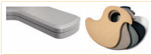
Figure 4 —Product examples of UV-cured powder coating on MDF: built up MDF parts (left) and multi-component UV-cured powder coatings (right).

UV-cured powder coating on engineered wood composite, MDF, provides great design versatility. MDF is a readily available by-product of the wood industry and is a uniform and highly durable substrate used in a variety of finishing processes. UV-cured powder coating on MDF provides design flexibility and seamless finishing, not matched by wet and laminate finishing processes. MDF preheating enables the substrate to become conductive for