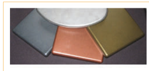
Figure 3—UV-cured powder coating metallic finishes on MDF.