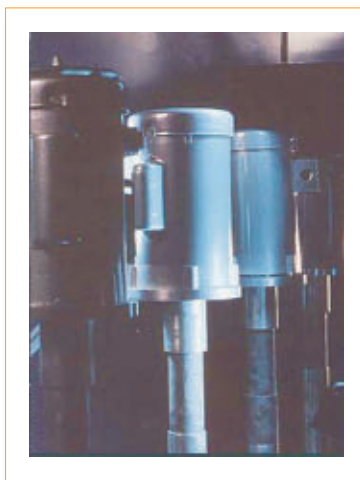
Figure 5 —Pre-assembled part finished with UV-cured powder coating.

UV-cured powder coatings are well suited to coat pre-assembled components containing heat-sensitive materials. Pre-assembled components can contain a number of different parts and materials that are required to function properly. These heat-sensitive materials may be plastic, rubber seals, electronic components, and gaskets or lubricating oils. Minimizing thermal exposure of these components is critical to maintain their performance and tolerances. The first commercial application of UV-cured powder coating was finishing a fully assembled electric motor ( Figure 5 ). The fully assembled motor contains electrical wiring and